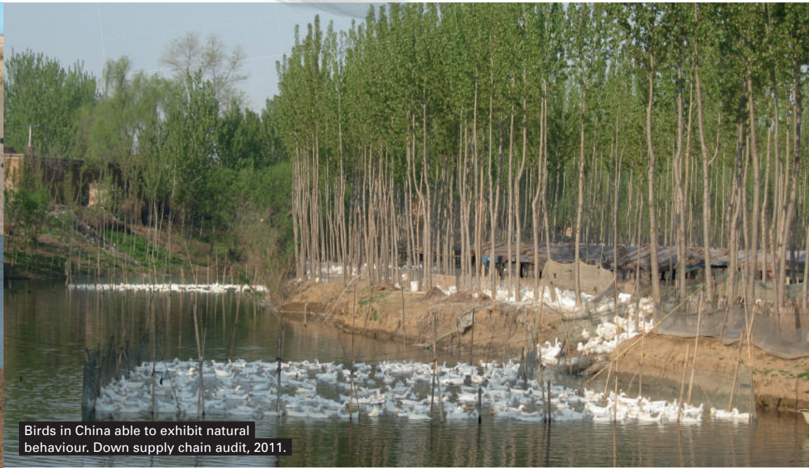
Birds in China able to exhibit natural behaviour. Down supply chain audit, 2011.