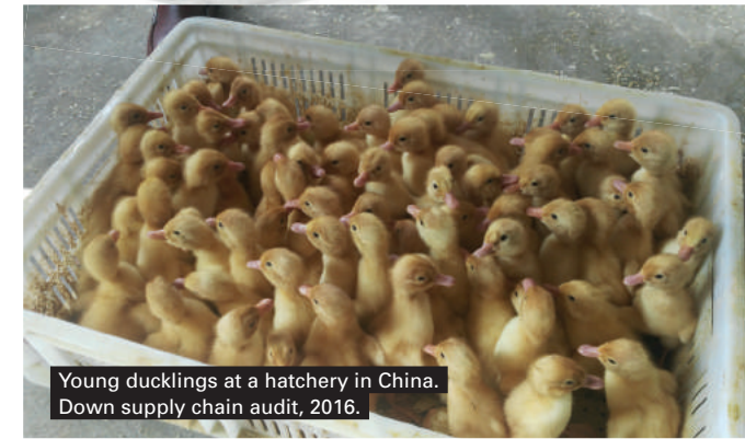
Young ducklings at a hatchery in China. Down supply chain audit, 2016.