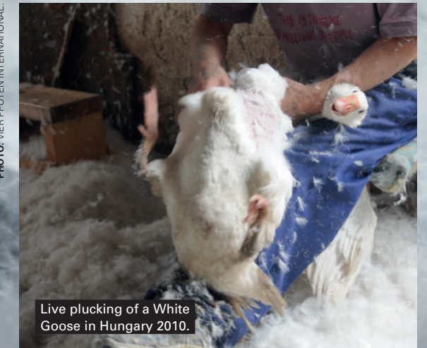
Live plucking of a White Goose in Hungary 2010.

Frank Thompson: Down farms are notified before they are audited. Can they clean their act up for one day?