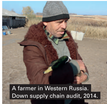
A farmer in Western Russia. Down supply chain audit, 2014.